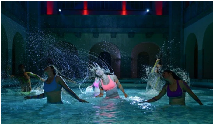
Berlin: Artists perform at the renovated Stadtbad Oderberger Strasse swimming pool on September 27, 2016, about two weeks before its re-opening.

It belongs to a hotel complex, but will open its doors also for the public.