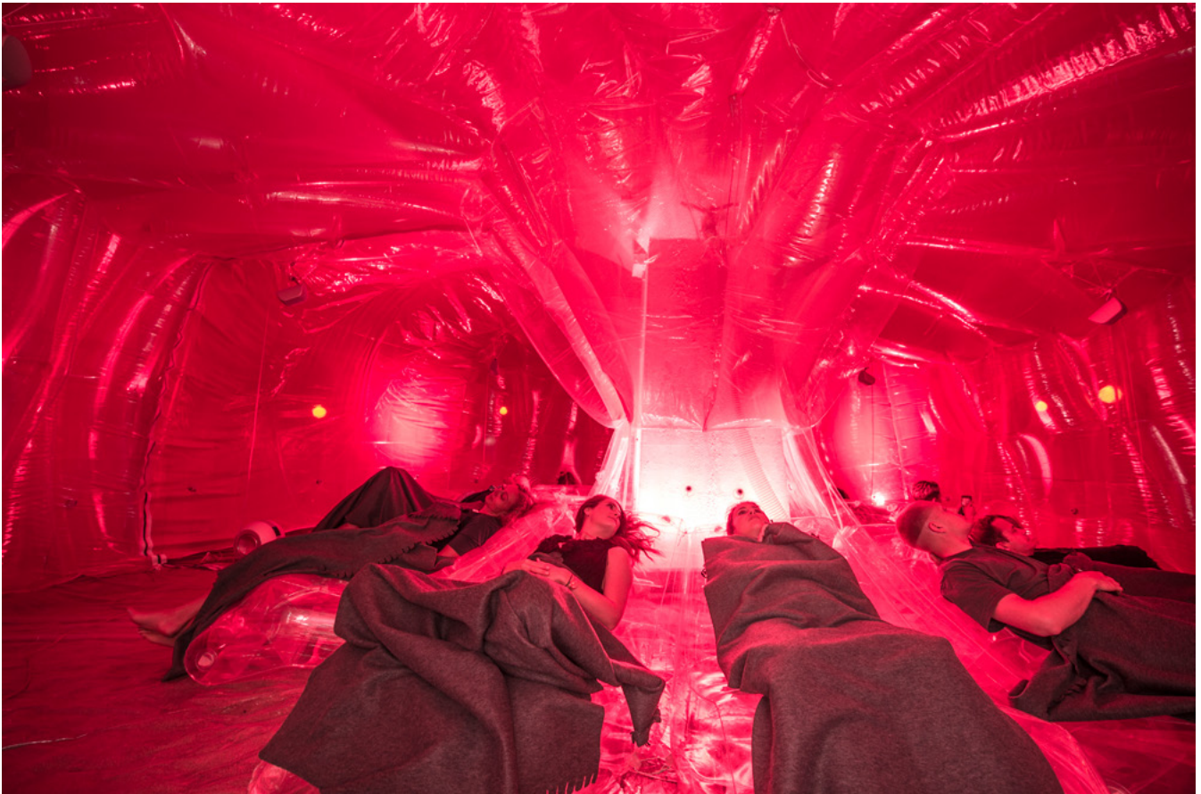
BREATH ing HEART - art installation of a walk-in heart at Art Basel 2017